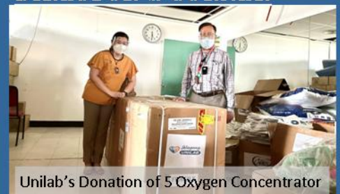
Unilab's Donation of 5 Oxygen Concentrator