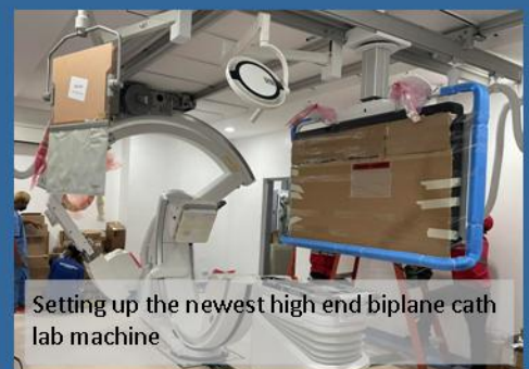
Setting up the newest high end biplane cath lab machine